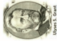
Ulysses S. Grant